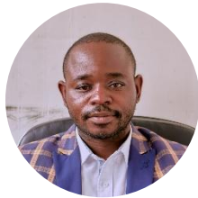
Emile Muhindo-Milonde National Institute Biomedical Research Goma, DRC