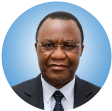
The Hon. William Vangimembe Lukuvi (MP) Minister of State Prime Minister's Office (Policy, Parliament, and Coordination), Tanzania